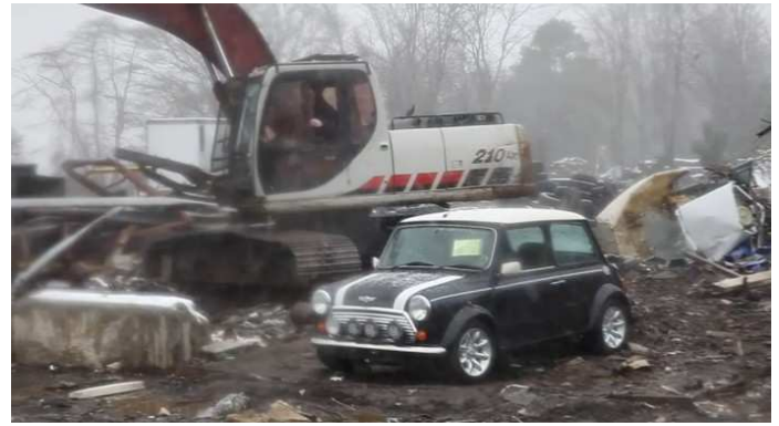
VIN-swapped Mini Cooper awaits crushing.

BMW: 2015 4 series convertibles. Driver's front air bag deployment timing can be incorrect. 2067 units. NHTSA recall # 15V148.